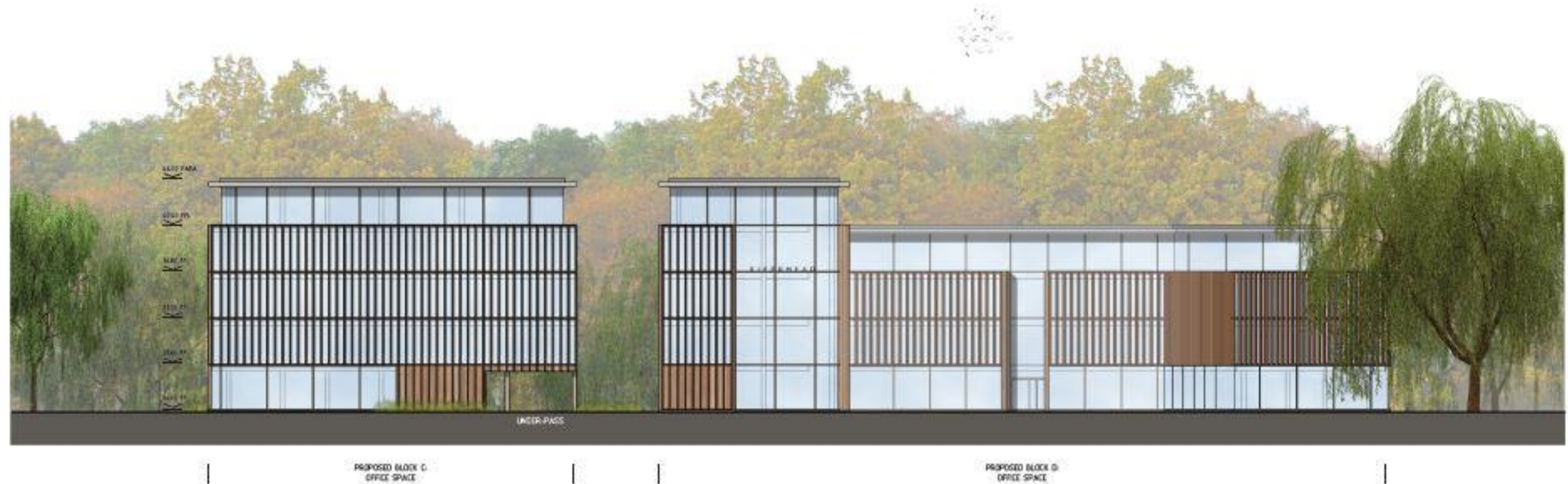
AS PROPOSED: STREET-SCENE (CC)