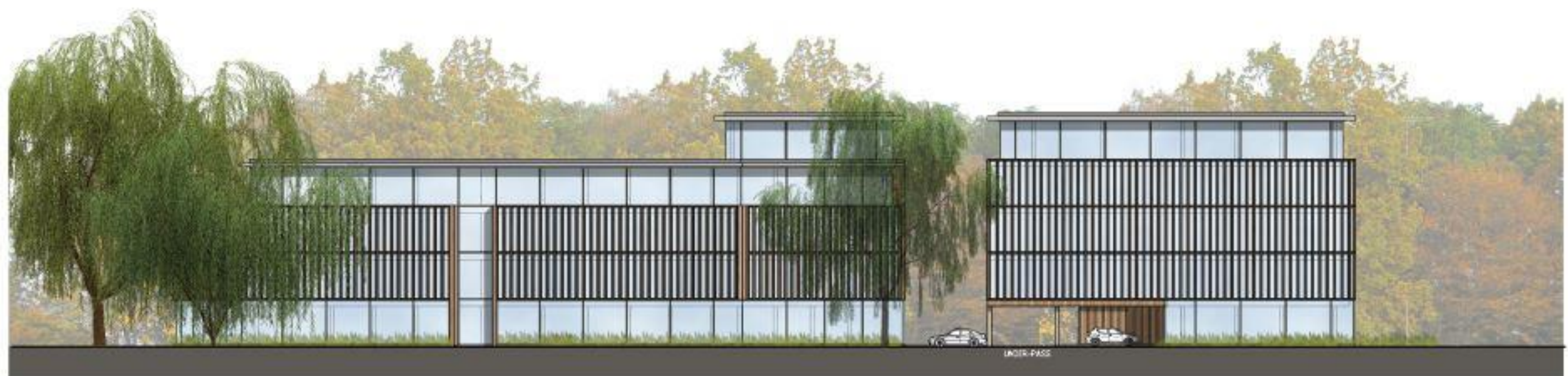
AS PROPOSED: STREET-SCENE (DD)